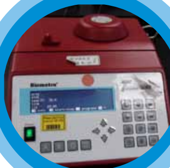
PCR for gene synthesis

For more information on WuXi AppTec's services please contact: