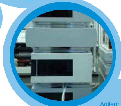
Agilent 1200 HPLC for analysis and small scale purification