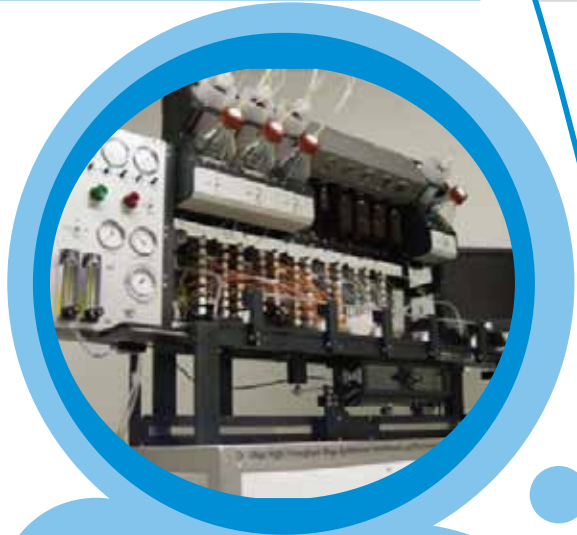
Dr. Oligo 192 DNA Synthesizer For high throughput oligonucleotide synthesis