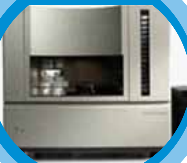
ABI 3730 for Sequencing confirmation

Well organized laboratory operated by experienced scientists and equipped with state-of-art instruments